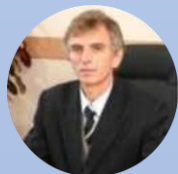
Doctor of Economics, Professor, Vice-Rector for Scientific and Pedagogical Work Kyiv National University of Economics named after Vadim Hetman