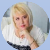
Head of the Department of Business Economics and Entrepreneurship of Kyiv National Economic University n. a. Vadim Hetman