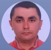
Deputy Chief of Staff in the Sumy Regional State Administration, lawyer