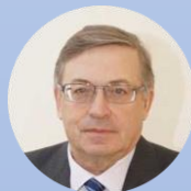
Doctor of Economics, Professor of the Department of Regional Studies and Tourism in Kyiv National Economic University n. a. Vadim Hetman, Honored Worker of Education of Ukraine