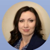
Doctor of Science in Economics, Professor Kyiv National Economic University n. a. Vadim Hetman