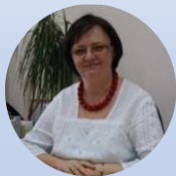
Doctor of Economics, Professor, Honored Worker of Ukraine in Kyiv National Economic University n. a. Vadim Hetman