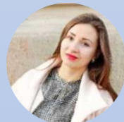
Leading specialist of the Department for the Observance of the Rights of Internally Displaced Persons in Secretariat of the Ukrainian Parliament Commissioner for Human Rights