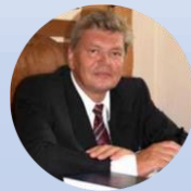
Rector of Kyiv National Economic University n. a. Vadim Hetman