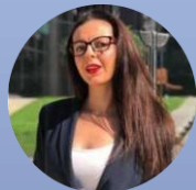
Director of Representative Office West support inc. in Ukraine