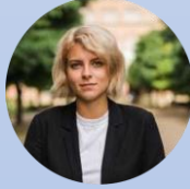
Member of the Committee on Human Rights, DE occupation and Reintegration of Temporarily Occupied Territories in Donetsk, Luhansk Regions and the Autonomous Republic of Crimea, National Minorities and Interethnic Relations.