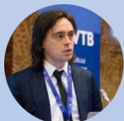
Director of Institute of Modeling and Informational Technologies in Economics, Professor of Chair of Mathematical Modelling and Statistics of Kyiv National Economic University named after Vadim Hetman