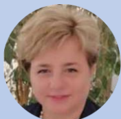
Doctor of Economics, Professor, an expert on regional development, Head of Socioeconomics and Personnel Management Department Kyiv National Economic University n. a. Vadim Hetman