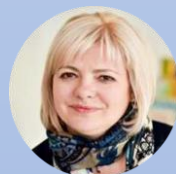
Ph.D., Psychology Department of Pedagogy and Psychology Faculty of Personnel Management in Kyiv National Economic University n. a. Vadim Hetman