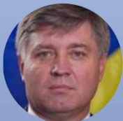
Head of the Department of international management Kyiv National Economic University n. a. Vadim Hetman, PhD in Economics, associate professor